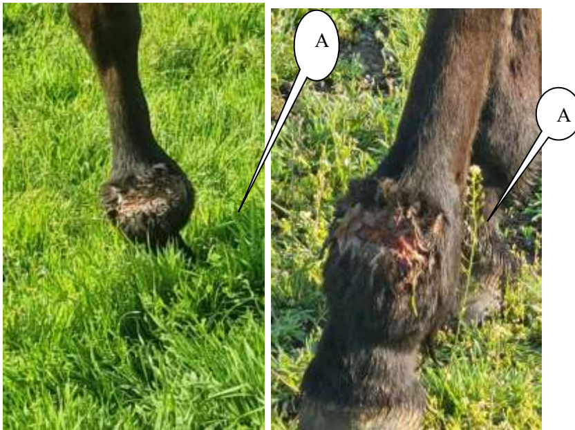
Figure 1. Day 5 of the experiment. Figure 2. 10th day of experiment.

When treating the first experimental group, the horses' joints were subjected to surgical treatment, the wound was cleaned with H 2 O 2 , enrofloxacin 10% - 6 ml intramuscularly, platelet autoserum 4 ml intra-articularly once every 3 days, and Levomekol ointment was administered. After the pus drained, 2 ml of chondrolone was injected into the joint, 5 ml of Miosta H® was injected into the neck muscle, and 10 days later a second time - 5 ml between the neck muscle joints. By the 5th day of treatment, severe pain in the joints of horses, partial loss of appetite and increased body temperature, lameness in parts of the legs, decreased mobility, swelling and local temperature were observed. By the 7th day of the experiment, the discharge of pus from the joints of the horses stopped, body temperature decreased, lameness in the legs decreased, swelling of the joints and local temperature decreased.