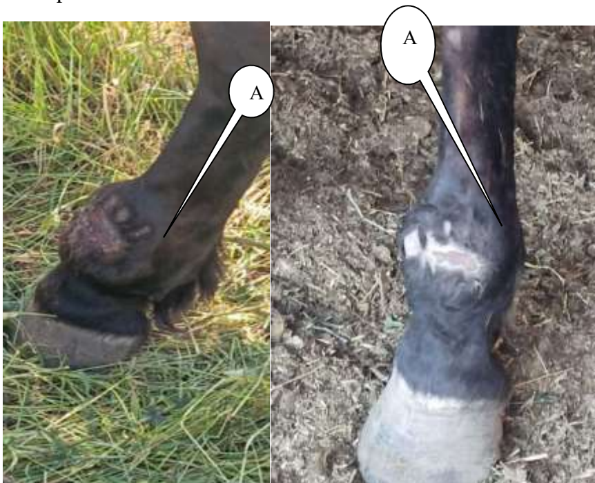
Figure 3. Day 15 of the experiment. Figure 4. Day 19 of the experiment.

When treating the first experimental group, the horses' joints were subjected to surgical treatment, the wound was cleaned with H 2 O 2 , enrofloxacin 10% - 6 ml intramuscularly, platelet autoserum 4 ml intra-articularly once every 3 days, and Levomekol ointment was administered. After the pus drained, 2 ml of chondrolone was injected into the joint, 5 ml of Miosta H® was injected into the neck muscle, and 10 days later a second time - 5 ml between the neck muscle joints. By the 5th day of treatment, severe pain in the joints of horses, partial loss of appetite and increased body temperature, lameness in parts of the legs, decreased mobility, swelling and local temperature were observed. By the 7th day of the experiment, the discharge of pus from the joints of the horses stopped, body temperature decreased, lameness in the legs decreased, swelling of the joints and local temperature decreased.