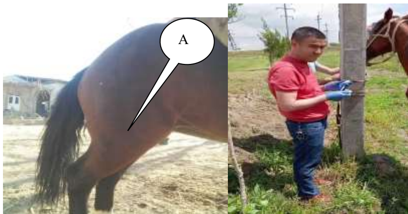
Figure 7. Day 19 of the experiment. Figure 8. Procedure for administering Miosta H®.

From the 15th day of treatment, clinical examination of infected animals noted that the pathological defect was dry, the wound was covered with young granulation tissue, the skin around the joints was significantly reduced, the swelling around it was reduced, the elasticity of the fingers was significantly restored, and the function of the fingers was restored. The skin and hair of horses are light, shiny, normal skin is noted, growth and development of hair is good (Figures 1-7).