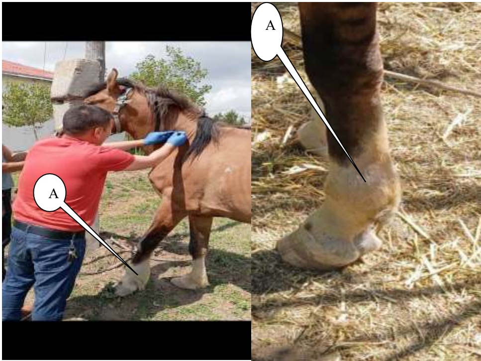
Figure 13. Day 10 of the experiment. Figure 14. Day 14 of the experiment.

Based on the data obtained from experiments, we can conclude that the treatment of chronic aseptic inflammation of the joints is aimed primarily at reducing proliferative, fibrinoplastic processes, tissue softening and extensive scarring; in the treatment of this pathology, various methods and means are used to normalize inflammation and improve blood - and lymph circulation, destruction of connective tissue, causing proliferative inflammation and scar formation.