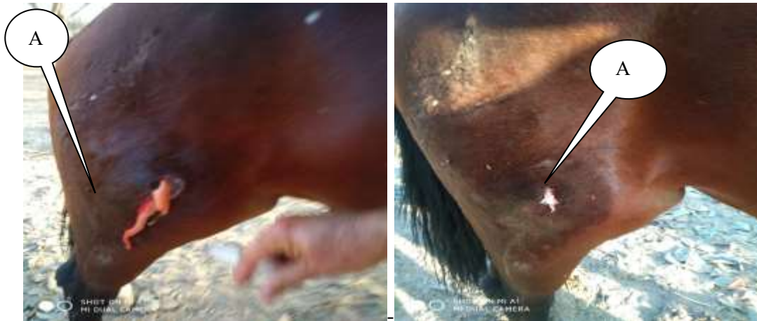
Figure 5. Day 5 of the experiment. Figure 6. Day 10 of the experiment.

The first experimental group of animals with purulent inflammation of the knee joint received the drug Miosta H® (A).