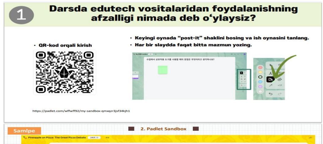
Figure 2. Information about Accessing the Padlet Sandbox Platform.

The objectives of the study are as follows: