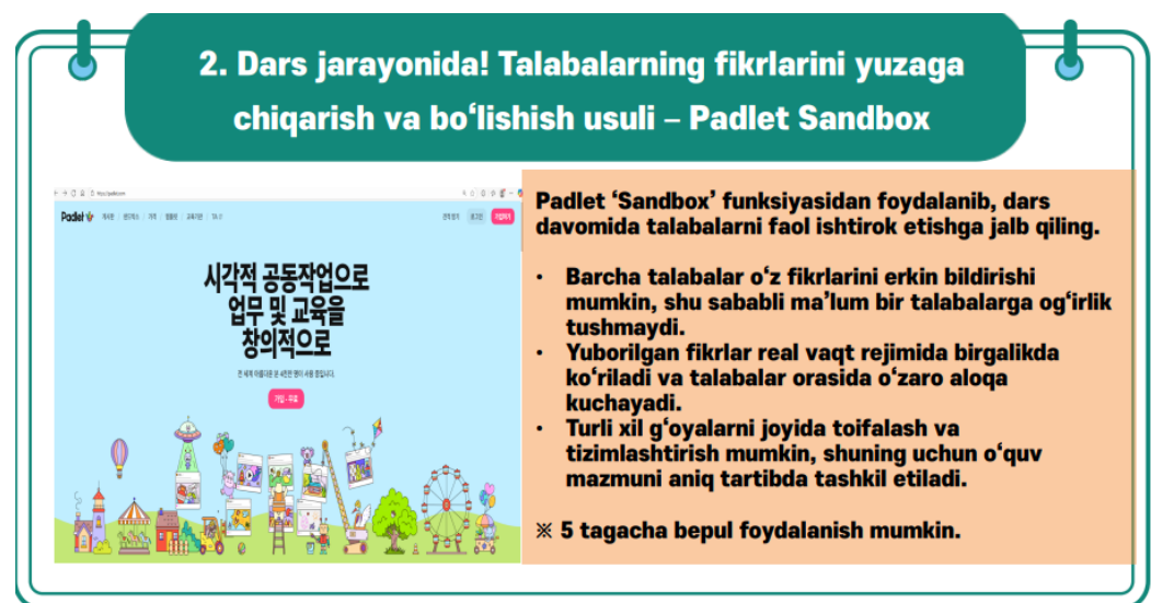
Figure 1. General Overview of the Padlet Sandbox Platform.

The purpose of this study is to determine the effectiveness of the Padlet Sandbox platform in facilitating the expression and sharing of higher education students' opinions, as well as to examine the psychological and pedagogical aspects of this process. The novelty of the research lies in the fact that, for the first time in the context of higher education in Uzbekistan, the effectiveness of the Padlet Sandbox platform in enabling students to express and share their ideas is examined comprehensively, and the psychological mechanisms of the platform's influence are also analyzed [5]. The process of organizing the expression and sharing of students' ideas through the Padlet Sandbox platform is structured as follows: