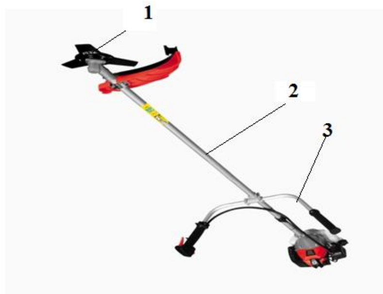
Figure 1. A view of the EVT-1200 lawn mower

The EVT-1200 mobile lawn mower of the ERA company of the People's Republic of China carries out working processes while hanging on the shoulder. Its power is equal to 1200 W, and a two-stroke gasoline engine is installed on it. The rotation speed of the cutting device is equal to 8500 rpm. The productivity of EVT-1200 can mow about 70...80 m 2 of grass in one hour. The coverage width of this machine is from 255 mm to 400 mm (Fig. 1). Its working body fixed to the bar is mainly made of strong flexible material. The advantage of this is that it has the same ability to mow the grass under the narrow, concrete or steel post. As for the disadvantages, it does not ensure the same mowing height, the device is difficult to control while hanging on the shoulder, and the labor and energy consumption is also high, this device cannot cut dry grass. Because a flexible working body does not allow this. Below is the view of the EVT-1200 type knife machine (Fig. 1).