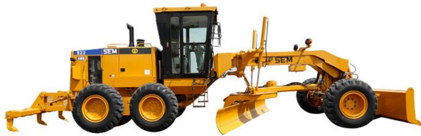
Figure 1. Overview of the SEM922 AWD Autograder, equipped with an additional ripper and bulldozer dump

Graders are classified according to their structural mass as light (up to 9 tons), medium (up to 13 tons), and heavy (up to 19 tons), and according to the wheel layout, determined by the wheel formula A \times B \times V (where A is the number of axles with the driven or control wheel, B is the number of axles with the driven wheel, and V is the total number of axles).