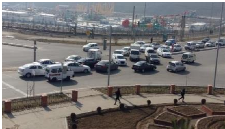
Figure 2. Intersection of Islam Karimov and Galaba streets.

Due to traffic jams at the intersection of "Islam Karimov" and "Galaba" streets, disorder and dangerous situations are arising at the intersection. The danger level of critical points at the intersection is increasing [5].