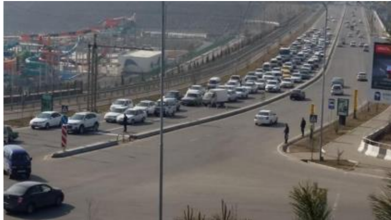
Figure 1. Traffic jam at the intersection of Islam Karimov and Galaba streets.

As a result of traffic jams at the intersection of Islam Karimov and Galaba streets, passengers arrive late, and ambulances and special service vehicles get stuck in traffic jams. The intersection of Islam Karimov and Galaba streets is one of the main streets of the city of Namangan.